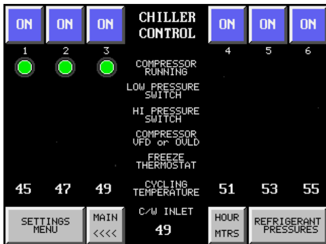
Chiller Control Screen